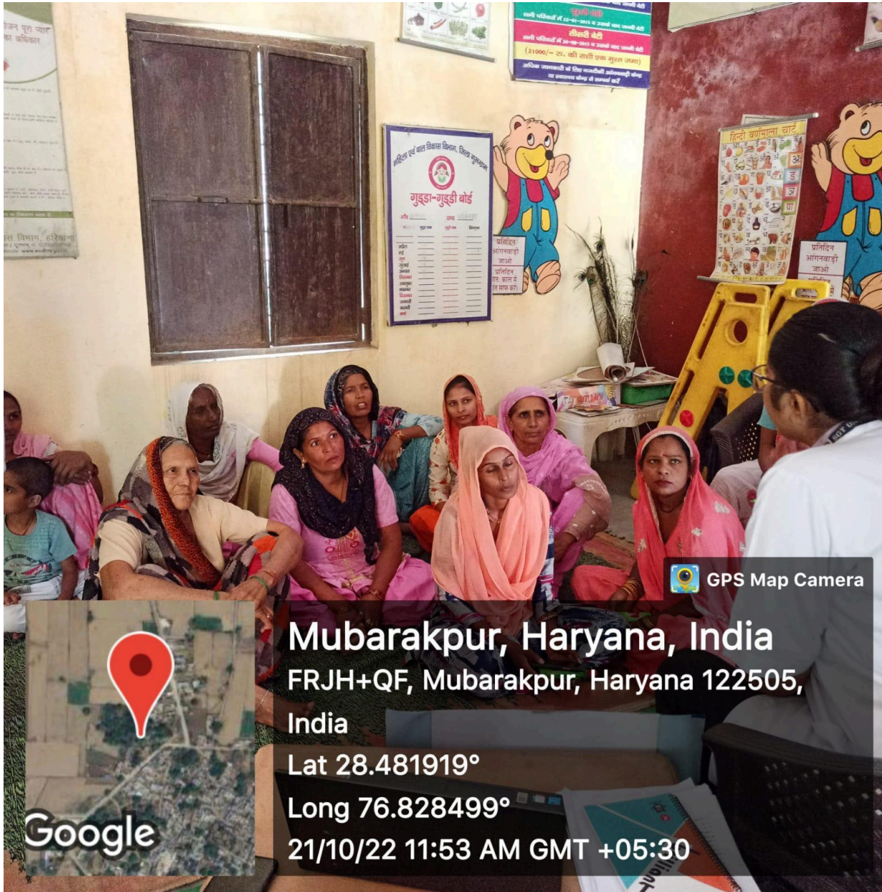
Women participants at the Program

SHREE GURU GOBIND SINGH TRICENTENARY UNIVERSITY (UGC & AICTE Approved) Gurugram, Delhi-NCR